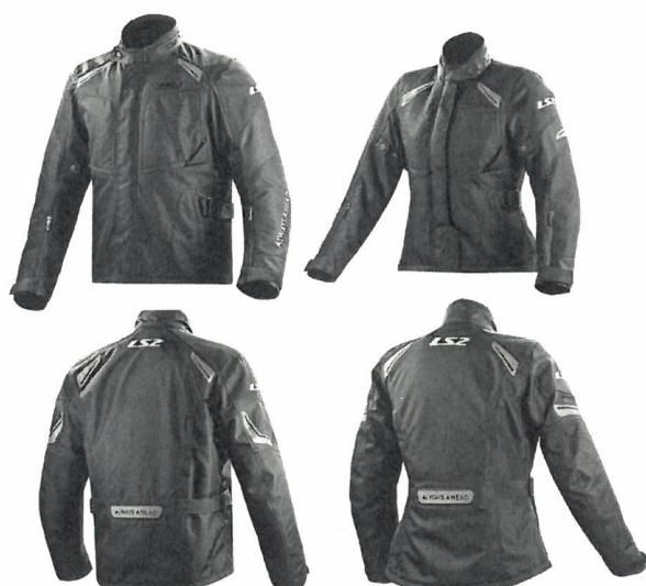
Man version (black)